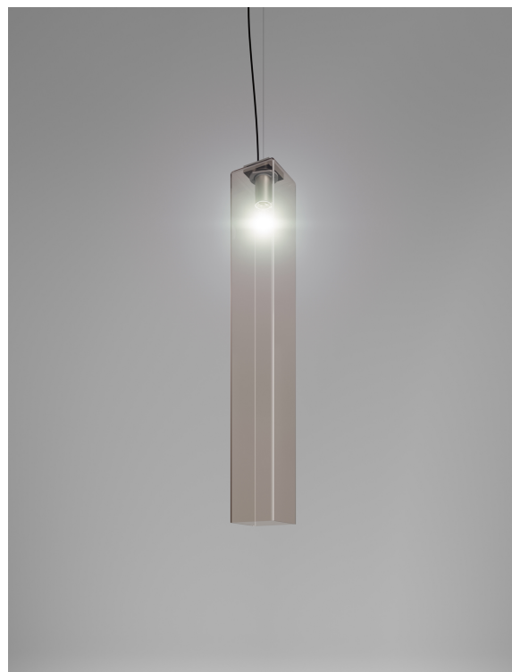
TUBES SP 90 FUTR NO E27 CE