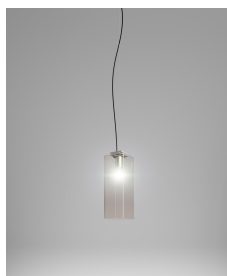
TUBES SP 40