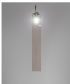
TUBES SP 120