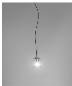
TUBES SP 20