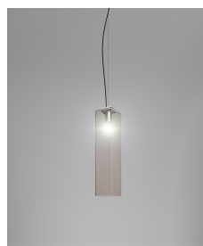
TUBES SP 60